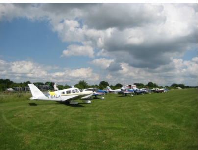
(The great French invasion (French fly-in) 13th June 2009)

Over the year we have had many visitors to the airfield and they continue to comment on how well kept the airfield is and how all staff endeavour to maintain the up keep to high standards. General up keep again includes the regular grass cutting ( thanks to Bill